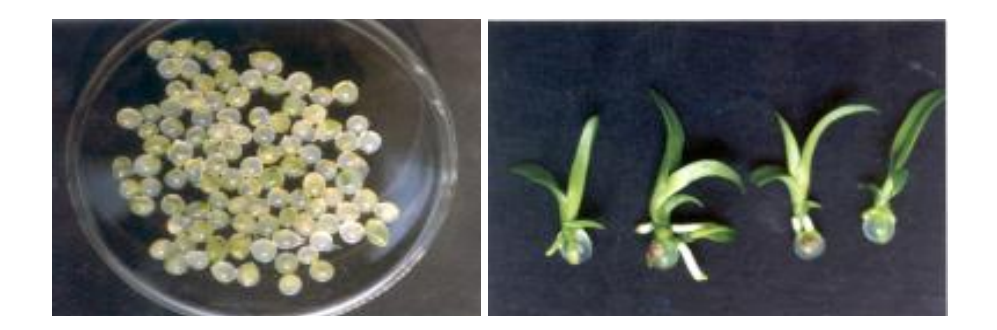
Figure 1 (left). Artificial or synthetic seed produced in orchids by alginate encapsulation. Figure 2 (right). Artificial or synthetic seed derived plantlets in orchid.

Several gels like agar, alginate, polyco 2133 (Bordon Co.), carboxy methyl cellulose, carrageenan, gelrite (Kelko. Co.), guargum, sodium pectate, tragacanth gum, etc. were tested for synthetic seed production, out of which alginate encapsulation was found to be more suitable and practicable for synthetic seed production. Alginate hydrogel is frequently selected as a matrix for synthetic seed because of its moderate viscosity and low spin ability of solution, low toxicity for somatic embryos and quick gelation, low cost and bio-compatibility characteristics. The use of agar as gel matrix was deliberately avoided as it is considered inferior to alginate with respect to long term storage. Alginate was chosen because it enhances capsule formation and also the rigidity of alginate beads provides better protection (than agar) to the encased somatic embryos against mechanical injury. Alginate encapsulated somatic embryos of orchids are shown in Figure 1 and the plantlets derived from artificial or synthetic seeds of orchid are shown in Figure 2.